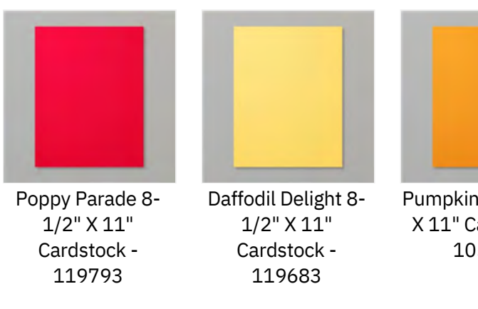
Pumpkin Pie 8-1/2" X 11" Cardstock -105117