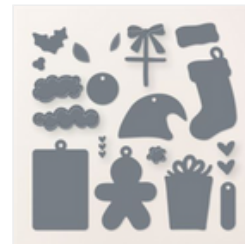
Sending Cheer Dies - 162052