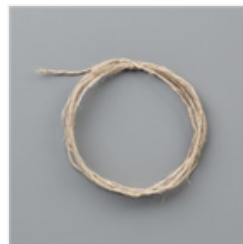
Linen Thread - 104199