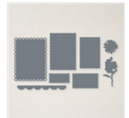
Scalloped Contours Dies - 155560