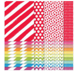
Brights 6" X 6" (15.2 X 15.2 Cm) Designer Series Paper - 161643