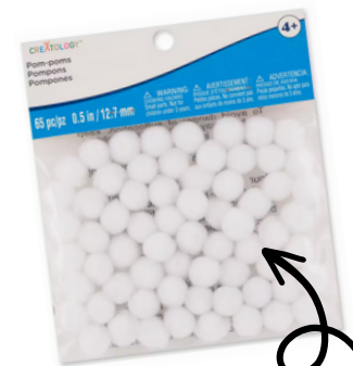
I got 1/2" Pom Poms for the Santa Hat from Michaels