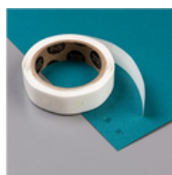
Mini Glue Dots - 103683