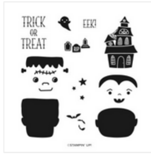
Tricks & Treats Photopolymer Stamp Set (English) - 162223