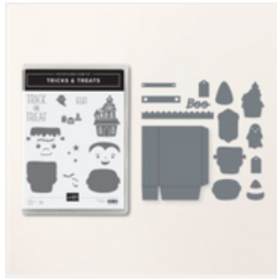
Tricks & Treats Bundle (English) - 162226

Tami White tami@stampwithtami.com www.stampwithtami.com