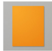
Pumpkin Pie 8-1/2" X 11" Cardstock - 105117