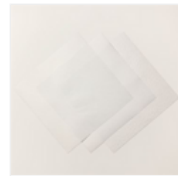
Vellum Basics 12" X 12" Specialty Designer Series Paper - 160839