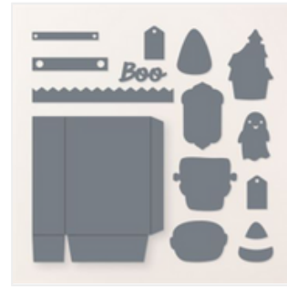
Tricks & Treats Dies - 162225