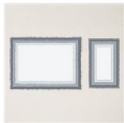
Deckled Rectangles Dies - 159173