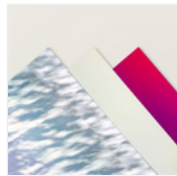
Holographic Trio 12" X 12" Specialty Paper - 161744