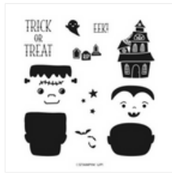
Tricks & Treats Photopolymer Stamp Set (English) - 162223