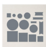
Stylish Shapes Dies - 159183