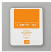
Pumpkin Pie Classic Stampin' Pad - 147086