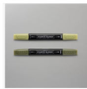
Mossy Meadow Stampin' Blends Combo Pack - 154890