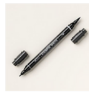
Basic Black Stampin' Write Marker - 162481