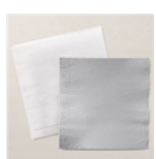
Timber 3D Embossing Folder - 156406