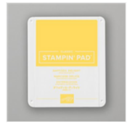
Daffodil Delight Classic Stampin' Pad - 147094