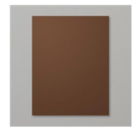
Early Espresso 8-1/2" X 11" Cardstock - 119686