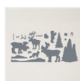
Reindeer Dies - 159727