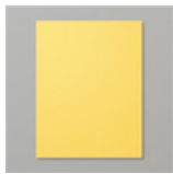
Daffodil Delight 8-1/2" X 11" Cardstock - 119683