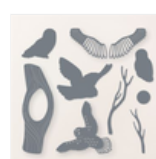
Winter Owls Dies - 162156