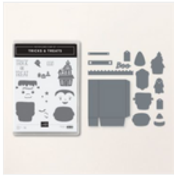
Tricks & Treats Bundle (English) - 162226

Tami White tami@stampwithtami.com www.stampwithtami.com