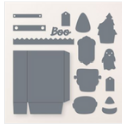
Tricks & Treats Dies - 162225