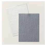
Christmas Tidings Embossing Folder - 162115