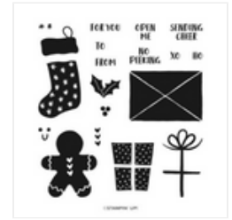
Sending Cheer Photopolymer Stamp Set (English) - 162050