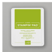
Granny Apple Green Classic Stampin' Pad - 147095