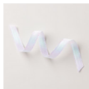
White 1/2" (1.3 Cm) Iridescent Ribbon - 161955