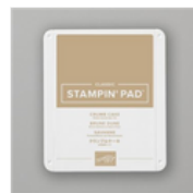
Crumb Cake Classic Stampin' Pad - 147116