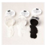
Basics Embossing Powders - 155554