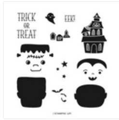
Tricks & Treats Photopolymer Stamp Set (English) - 162223