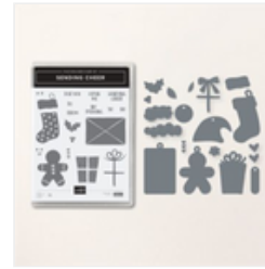
Sending Cheer Bundle (English) - 162053