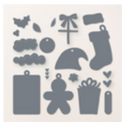
Sending Cheer Dies - 162052