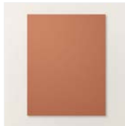
Copper Clay 8-1/2" X 11" Cardstock - 161721