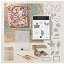
All About Autumn Suite Collection (English) - 162193

Tami White tami@stampwithtami.com www.stampwithtami.com