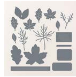
Autumn Leaves Dies - 162185