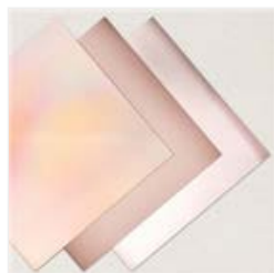
Rose Gold 12" X 12" (30.5 X 30.5 Cm) Specialty Paper - 159139