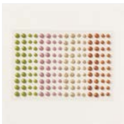
Adhesive-Backed Speckled Dots - 162191