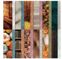
All About Autumn 6" X 6" (15.2 X 15.2 Cm) Specialty Designer Series Paper - 162178