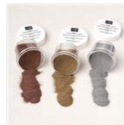
Metallics Embossing Powders - 155555