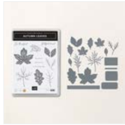
Autumn Leaves Bundle (English) - 162186