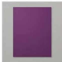
Blackberry Bliss 8-1/2" X 11" Cardstock - 133675