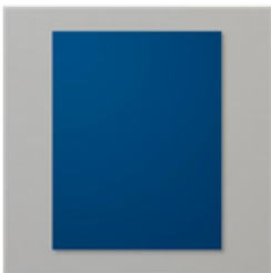
Night Of Navy 8-1/2" X 11" Cardstock - 100867