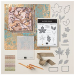
All About Autumn Suite Collection (English) - 162193

Tami White tami@stampwithtami.com www.stampwithtami.com