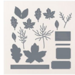
Autumn Leaves Dies - 162185