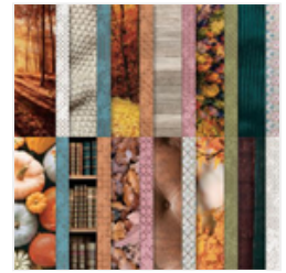
All About Autumn 6" X 6" (15.2 X 15.2 Cm) Specialty Designer Series Paper - 162178