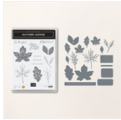
Autumn Leaves Bundle (English) - 162186