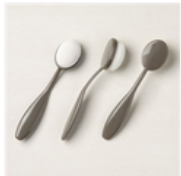
Blending Brushes - 153611