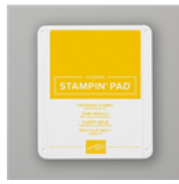
Crushed Curry Classic Stampin' Pad - 147087