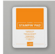
Pumpkin Pie Classic Stampin' Pad - 147086