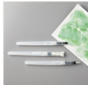
Water Painters - 151298