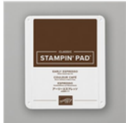
Early Espresso Classic Stampin' Pad - 147114