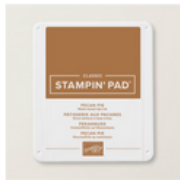
Pecan Pie Classic Stampin' Pad - 161665