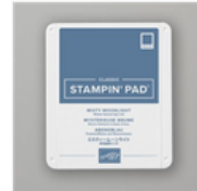
Misty Moonlight Classic Stampin' Pad - 153118