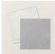
Snowflake Sky 3D Embossing Folder - 162026