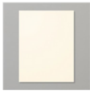
Very Vanilla 8-1/2" X 11" Cardstock - 101650