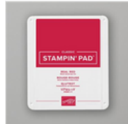
Real Red Classic Stampin' Pad - 147084