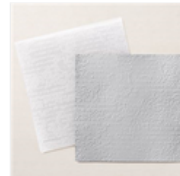
Timeworn Type 3D Embossing Folder - 156505