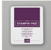
Blackberry Bliss Classic Stampin' Pad - 147092