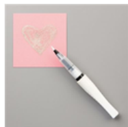
Wink Of Stella Clear Glitter Brush - 141897