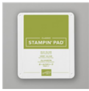
Old Olive Classic Stampin' Pad - 147090