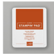
Cajun Craze Classic Stampin' Pad - 147085