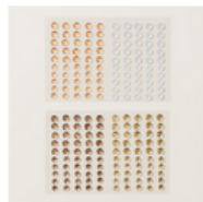
Neutrals Adhesive- Backed Sequins - 161627