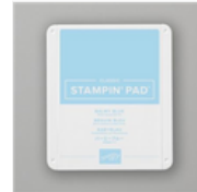
Balmy Blue Classic Stampin' Pad - 147105