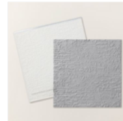
Exposed Brick 3D Embossing Folder - 161600