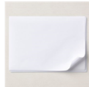
Stampin' Up! Masking Paper - 155480