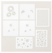
Abundant Beauty Decorative Masks - 162331