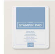
Boho Blue Classic Stampin' Pad - 161650