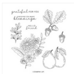
Fruitful Blessings Cling Stamp Set (English) - 162203