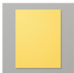
Daffodil Delight 8-1/2" X 11" Cardstock - 119683