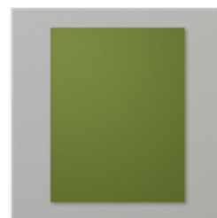
Mossy Meadow 8-1/2" X 11" Cardstock - 133676