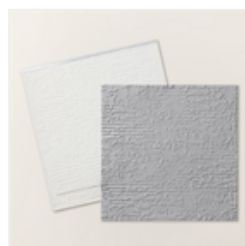
Exposed Brick 3D Embossing Folder - 161600