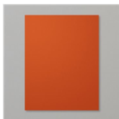
Cajun Craze 8-1/2" X 11" Cardstock - 119684