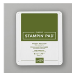
Mossy Meadow Classic Stampin' Pad - 147111