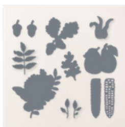
Fruitful Blessings Dies - 162209