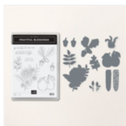
Fruitful Blessings Bundle (English) - 162210

Tami White tami@stampwithtami.com www.stampwithtami.com