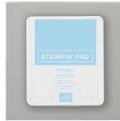
Balmy Blue Classic Stampin' Pad - 147105