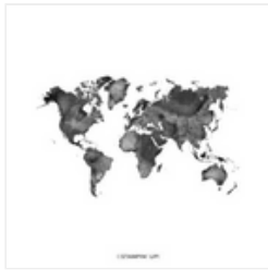
Watercolor World Cling Stamp Set - 160708