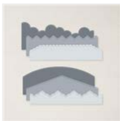
Basic Borders Dies - 155558