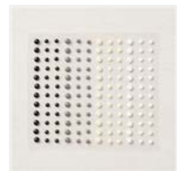
Classic Matte Dots - 158146