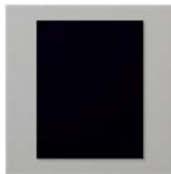
Basic Black 8-1/2" X 11" Cardstock - 121045