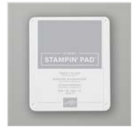
Smoky Slate Classic Stampin' Pad - 147113