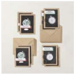
Timeless Greetings Kit (English) - 161062

Tami White tami@stampwithtami.com www.stampwithtami.com