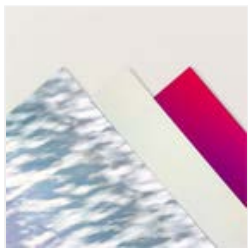
Holographic Trio 12" X 12" (30.5 X 30.5 Cm) Specialty Paper - 161744