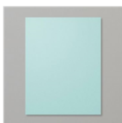
Pool Party 8-1/2" X 11" Cardstock - 122924