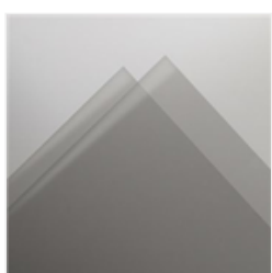
Window Sheets - 142314