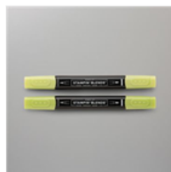
Granny Apple Green Stampin' Blends Combo Pack - 154885