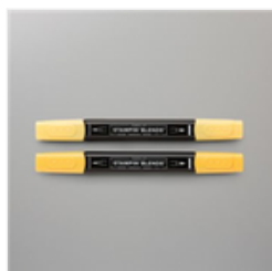
Daffodil Delight Stampin' Blends Combo Pack - 154883