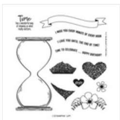
Time Together Photopolymer Stamp Set (English) - 161475