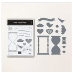
Time Together Bundle (English) - 161480

Tami White tami@stampwithtami.com www.stampwithtami.com