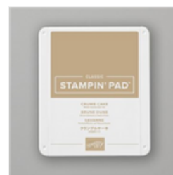
Crumb Cake Classic Stampin' Pad - 147116