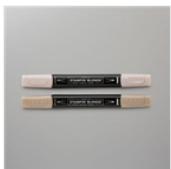
Crumb Cake Stampin' Blends Combo Pack - 154882