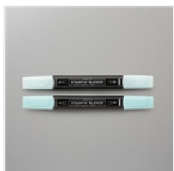
Pool Party Stampin' Blends Combo Pack - 154894