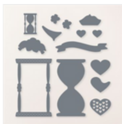
Time Together Dies - 161479