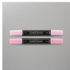
Flirty Flamingo Stampin' Blends Combo Pack - 154884