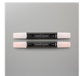
Petal Pink Stampin' Blends Combo Pack - 154893