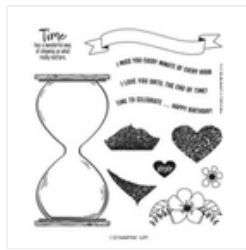
Time Together Photopolymer Stamp Set (English) - 161475