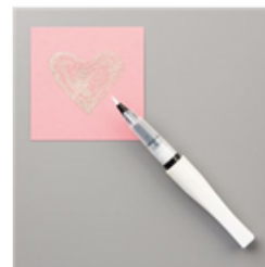
Wink Of Stella Clear Glitter Brush - 141897