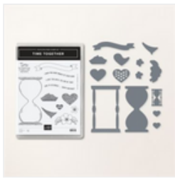
Time Together Bundle (English) - 161480

Tami White tami@stampwithtami.com www.stampwithtami.com