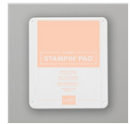
Petal Pink Classic Stampin' Pad - 147108