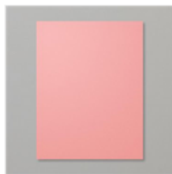
Flirty Flamingo 8-1/2" X 11" Cardstock - 141416