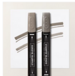
Pebbled Path Stampin' Blends Combo Pack - 161658