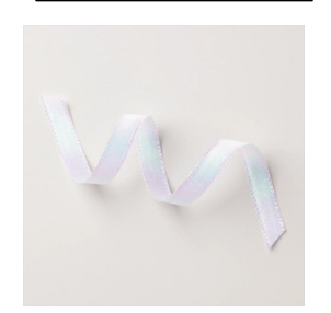
White 1/2" Iridescent Ribbon 161955