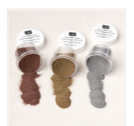
Metallics Embossing Powders - 155555