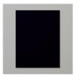
Basic Black 8-1/2" X 11" Cardstock -121045