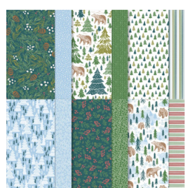
A Walk in the Forest 12" x 12" Designer Series Paper 162377