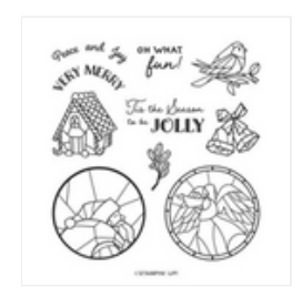
So Very Merry Photopolymer Stamp Set (English) - 162345