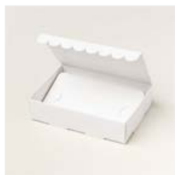
Scalloped Gift Card Boxes - 161751