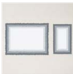
Deckled Rectangles Dies - 159173