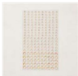
Iridescent Rhinestones Basic Jewels - 158130