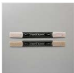
Crumb Cake Stampin' Blends Combo Pack - 154882