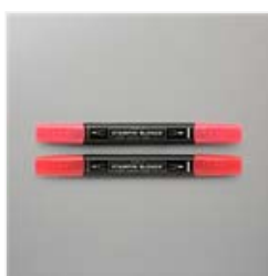
Poppy Parade Stampin' Blends Combo Pack - 154958