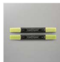
Granny Apple Green Stampin' Blends Combo Pack - 154885