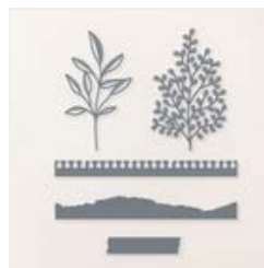
Gorgeously Made Dies - 161202