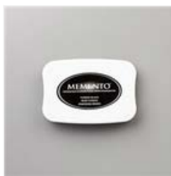
Tuxedo Black Memento Ink Pad - 132708