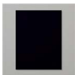
Basic Black 8-1/2" X 11" Cardstock - 121045