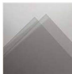
Window Sheets - 142314