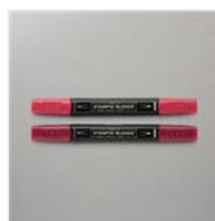
Cherry Cobbler Stampin' Blends Combo Pack - 154880