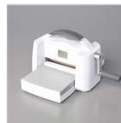
Stampin' Cut & Emboss Machine - 149653