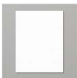
Basic White 8-1/2" X 11" Cardstock - 159276