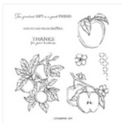
Apple Harvest Cling Stamp Set (English) - 159944

Tami White tami@stampwithtami.com www.stampwithtami.com