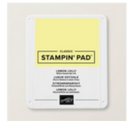
Lemon Lolly Classic Stampin' Pad - 161666