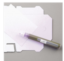
Stampin' Spritzer - 126185