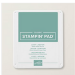
Lost Lagoon Classic Stampin' Pad - 161678