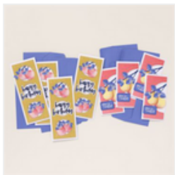
Blossom Wishes Kit - 162431

Tami White tami@stampwithtami.com www.stampwithtami.com