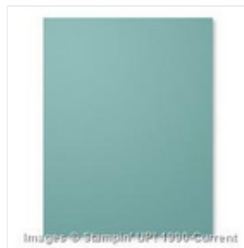
Lost Lagoon 8-1/2" X 11" Cardstock - 133679