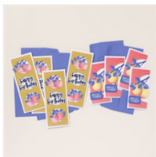
Blossom Wishes Kit - 162431

Tami White tami@stampwithtami.com www.stampwithtami.com