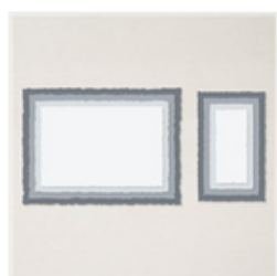
Deckled Rectangles Dies - 159173