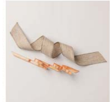
Copper & Natural Ribbon Combo Duo Pack 162192