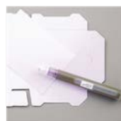
Stampin' Spritzer - 126185