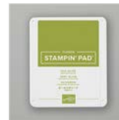
Old Olive Classic Stampin' Pad - 147090