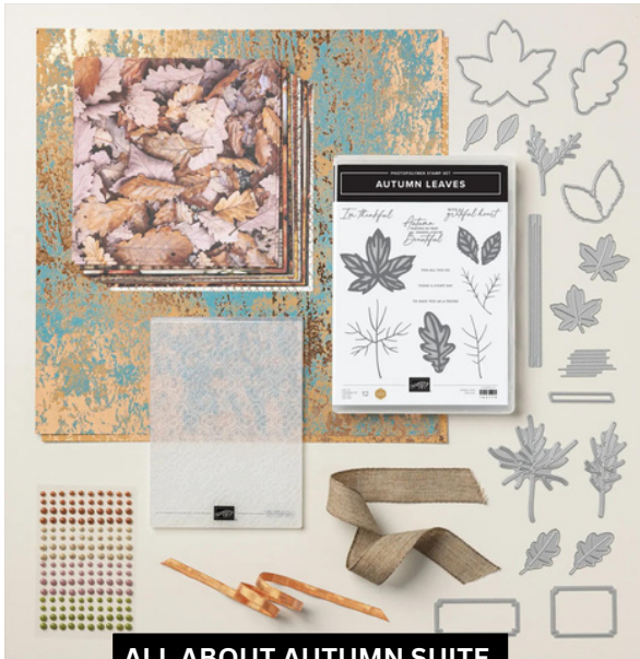
ALL ABOUT AUTUMN SUITE 2023 SEPT-DEC MINI CATALOG

Tami White tami@stampwithtami.com www.stampwithtami.com