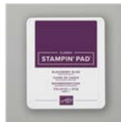
Blackberry Bliss Classic Stampin' Pad - 147092