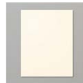
Very Vanilla 8-1/2" X 11" Cardstock - 101650