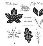
Autumn Leaves Stamp Set 162179