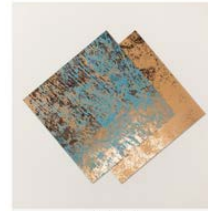
Oxidized Copper 12" x 12" Specialty Designer Series Paper