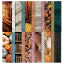
All About Autumn 6" x 6" Specialty Designer Series Paper 1621278