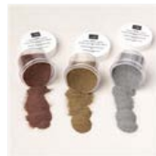
Metallics Embossing Powders - 155555