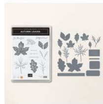
Autumn Leaves Bundle Save 10% With Bundle 162186