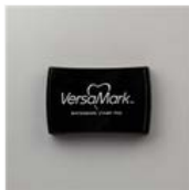
Versamark Pad - 102283