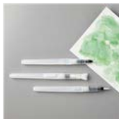
Water Painters - 151298