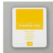
Crushed Curry Classic Stampin' Pad - 147087