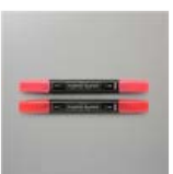
Poppy Parade Stampin' Blends Combo Pack - 154958