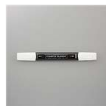
Stampin' Blends Color Lifter - 144608