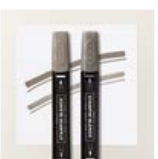
Pebbled Path Stampin' Blends Combo Pack - 161658