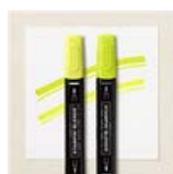
Parakeet Party Stampin' Blends Combo Pack - 159220