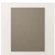
Pebbled Path 8-1/2" X 11" Cardstock - 161722