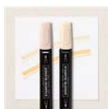
Stampin' Blends Medium Light Combo Pack - 159463