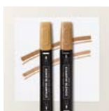
Pecan Pie Stampin' Blends Combo Pack - 161674