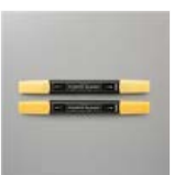
Daffodil Delight Stampin' Blends Combo Pack - 154883