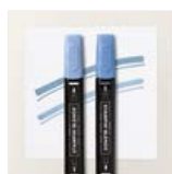
Boho Blue Stampin' Blends Combo Pack - 161659