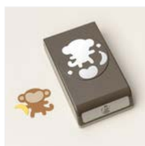
Little Monkey Builder Punch - 161378