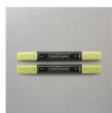
Granny Apple Green Stampin' Blends Combo Pack - 154885