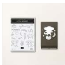
Little Monkey Bundle (English) - 161379

Tami White tami@stampwithtami.com www.stampwithtami.com