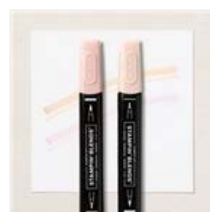
Stampin' Blends Light Combo Pack - 159465