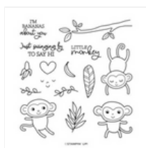
Little Monkey Photopolymer Stamp Set (English) - 161372