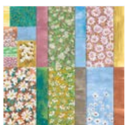
Fresh As A Daisy 12" X 12" (30.5 X 30.5 Cm) Designer Series Paper - 161289