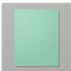
Coastal Cabana 8-1/2" X 11" Cardstock - 131297