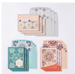
Colorful Kaleidoscope Kit (English) - 161804

Tami White tami@stampwithtami.com www.stampwithtami.com