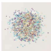
Iridescent Shaker Circles - 161625