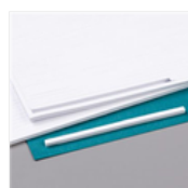
Foam Adhesive Strips - 141825