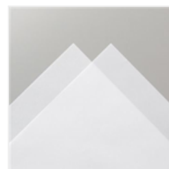
Vellum 8-1/2" X 11" Cardstock - 101856