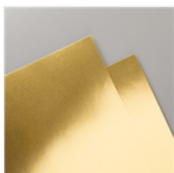
Gold Foil Sheets - 132622