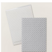
Metal Plate 3D Embossing Folder - 160766