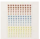
Adhesive-Backed Solid Gems - 161300