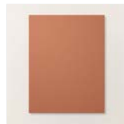
Copper Clay 8-1/2" X 11" Cardstock - 161721