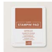
Copper Clay Classic Stampin' Pad - 161647