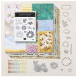
Fresh As A Daisy Suite Collection - 161301

Tami White tami@stampwithtami.com www.stampwithtami.com