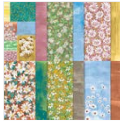
Fresh As A Daisy 12" X 12" Designer Series Paper - 161289