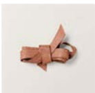
Copper Clay 3/8" Textured Ribbon - 161629