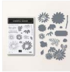
Cheerful Daisies Bundle (English) - 161297