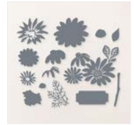
Cheerful Daisies Dies - 161296