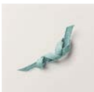
Lost Lagoon 1/4" (6.4 Mm) Bordered Ribbon - 161171