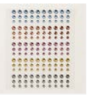
2023-2025 In Color™ Dots - 161620