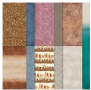
Earthen Elegance 12" X 12" Designer Series Paper - 161503