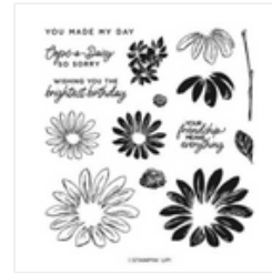
Cheerful Daisies Photopolymer Stamp Set - 161290