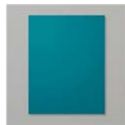
Pretty Peacock 8-1/2" X 11" Cardstock - 150880