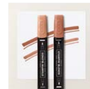
Copper Clay Stampin' Blends Combo Pack - 161662