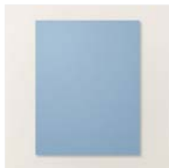
Boho Blue 8-1/2" X 11" Cardstock - 161724