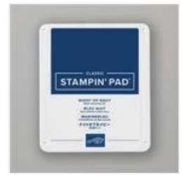
Night Of Navy Classic Stampin' Pad - 147110