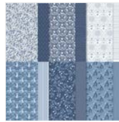
Countryside Inn 12" X 12" (30.5 X 30.5 Cm) Designer Series Paper - 161467