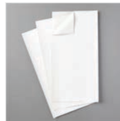
Adhesive Sheets - 152334