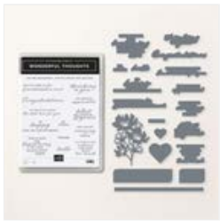
Wonderful Thoughts Bundle (English) - 161494

Tami White tami@stampwithtami.com www.stampwithtami.com