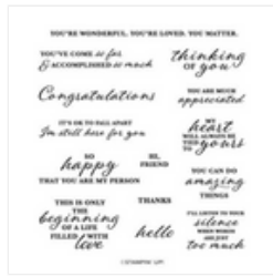
Wonderful Thoughts Photopolymer Stamp Set (English) - 161899