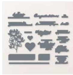
Wonderful Thoughts Dies (English) - 161491