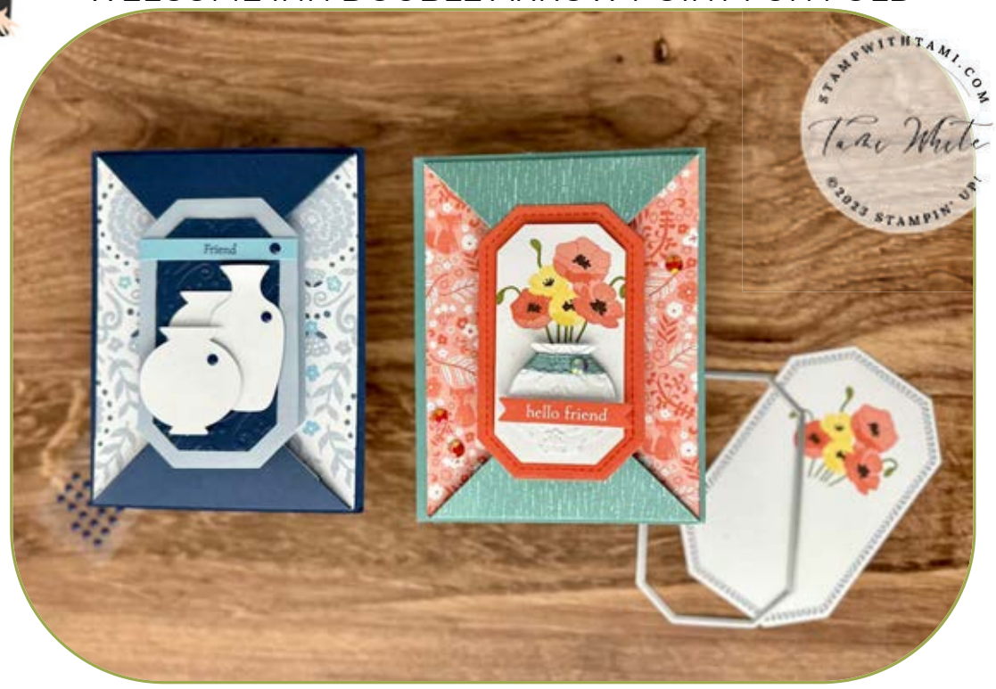
SEE VIDEO FOR HELP CREATING THE FOLD