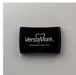
Versamark Pad - 102283