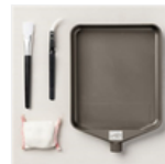
Embossing Additions Tool Kit - 159971