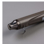
Heat Tool - 129053