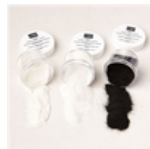
Basics Embossing Powders - 155554