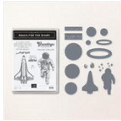
Reach For The Stars Bundle (English) - 161186