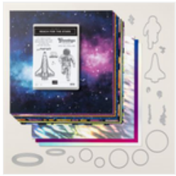
Stargazing Suite Collection (English) - 161189

Tami White tami@stampwithtami.com www.stampwithtami.com