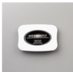
Tuxedo Black Memento Ink Pad - 132708