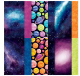
Stargazing 12" X 12" Designer Series Paper - 161175