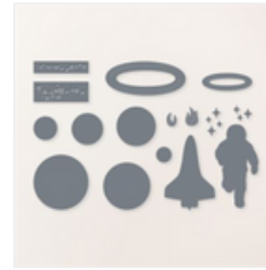
Reach For The Stars Dies - 161185