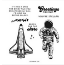
Reach For The Stars Cling Stamp Set (English) - 161176