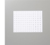
Rhinstone Basic Jewels - 144220