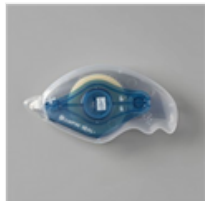
Stampin' Seal+ - 149699