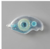
Stampin' Seal - 152813