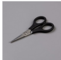
Paper Snips Scissors - 103579