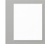
Basic White 8- 1/2" X 11" Cardstock - 159276