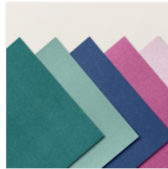
Soft Shimmer 12" X 12" (30.5 X 30.5 Cm) Specialty Paper - 161750