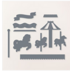
Carousel Horses Dies - 161465