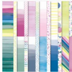
Bright & Beautiful 6" X 6" (15.2 X 15.2 Cm) Designer Series Paper - 161449