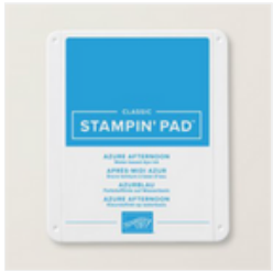
Azure Afternoon Classic Stampin' Pad - 161663