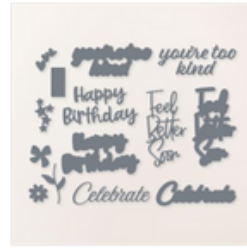
Wanted To Say Dies - 161594