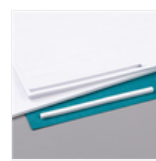
Foam Adhesive Strips - 141825