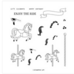
Carousel Horses Photopolymer Stamp Set (English) - 161463