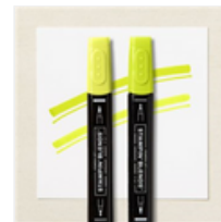
Parakeet Party Stampin' Blends Combo Pack - 159220