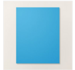
Azure Afternoon 8-1/2" X 11" Cardstock - 161719