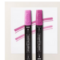
Berry Burst Stampin' Blends Combo Pack - 161681