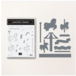
Carousel Horses Bundle - 161466

Tami White tami@stampwithtami.com www.stampwithtami.com