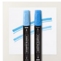
Azure Afternoon Stampin' Blends Combo Pack - 161672