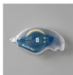
Stampin' Seal+ - 149699