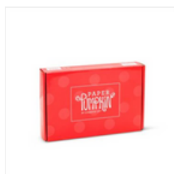
Prepaid Paper Pumpkin Subscription 1-Month - 137858

Tami White tami@stampwithtami.com www.stampwithtami.com