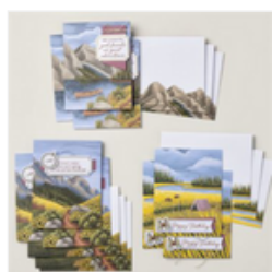
Exploring In Color Paper Pumpkin Refill - 163160