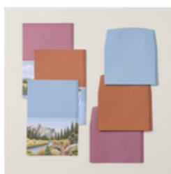
Exploring In Color Cards & Envelopes - 163113