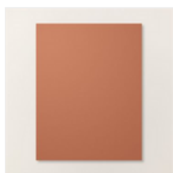
Copper Clay 8-1/2" X 11" Cardstock - 161721