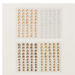
Neutrals Adhesive-Backed Sequins - 161627