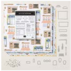
Les Shoppes Suite Collection (English) - 161337

Tami White tami@stampwithtami.com www.stampwithtami.com