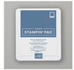
Misty Moonlight Classic Stampin' Pad - 153118