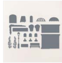
Let's Go Shopping Dies - 161332