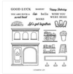
Let's Go Shopping Photopolymer Stamp Set (English) - 161777