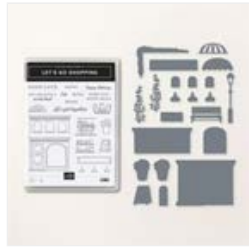
Let's Go Shopping Bundle (English) - 161333