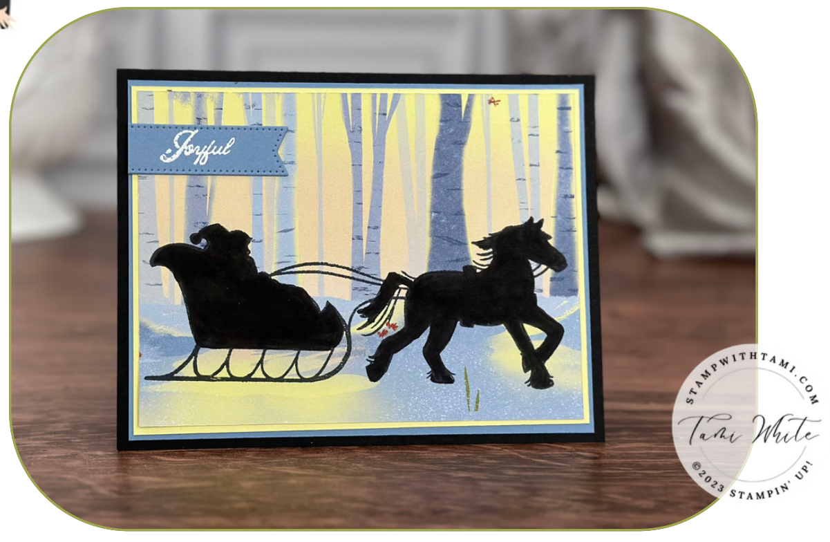
SEE MY PRE-ORDER VIDEO FOR HOW TO MAKE THIS CARD