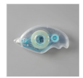
Stampin' Seal -152813