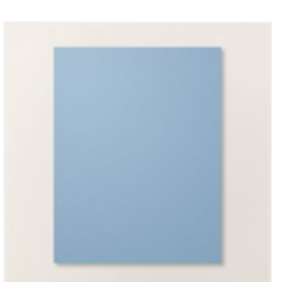
Boho Blue 8-1/2" X 11" Cardstock -161724