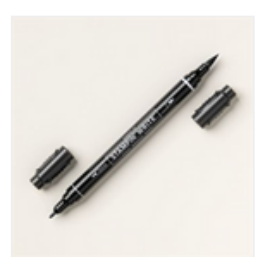
Basic Black Stampin' Write Marker - 162481