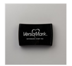
Versamark Pad - 102283

Pre-Order products are available to demonstrators and in demo kit now. These will be available to customers on July 6. See video or click here for more details.