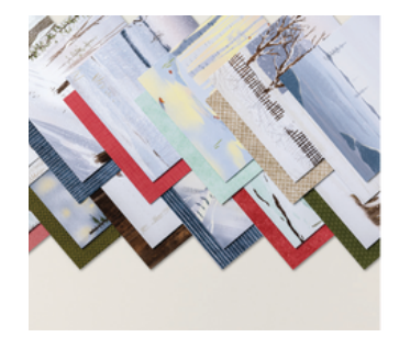
2. ONE HORSE OPEN SLEIGH 6" X 6" (15.2 X 15.2 CM) DESIGNER SERIES PAPER 162118 | $12.50 48 sheets; 4 each of 12 double-sided designs. Acid free, lignin free.

1. HORSE & SLEIGH BUNDLE 162126 | $58.00 $52.00 10% BUNDLES SAVINGS Photopolymer • EM FR Horse & Sleigh Stamp Set + Horse & Sleigh Dies