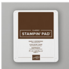
Early Espresso Classic Stampin' Pad - 147114

Pre-Order products are available to demonstrators and in demo kit now. These will be available to customers on July 6. See video or click here for more details.