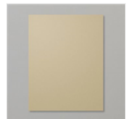
Crumb Cake 8-1/2" X 11" Cardstock - 120953