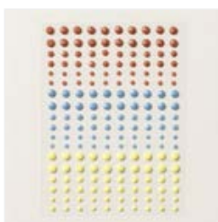
Adhesive-Backed Solid Gems - 161300