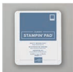
Misty Moonlight Classic Stampin' Pad - 153118