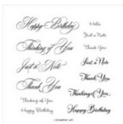
Go To Greetings Cling Stamp Set (English) - 158763

Tami White tami@stampwithtami.com www.stampwithtami.com