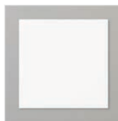
Basic White 12X12 (30.5 X 30.5 Cm) Cardstock - 159231