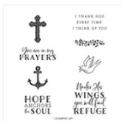
Hope & Prayer Cling Stamp Set (English) - 159009

Tami White tami@stampwithtami.com www.stampwithtami.com