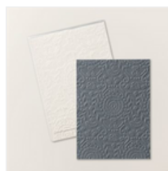
Countryside Blossoms Embossing Folder - 161473