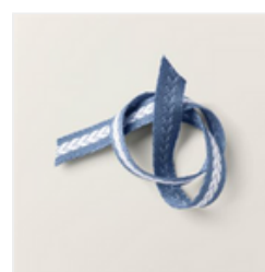
Misty Moonlight 3/8" (1 Cm) Inner Braid Ribbon - 161638