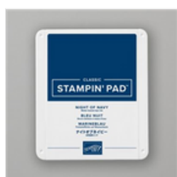
Night Of Navy Classic Stampin' Pad - 147110