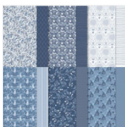
Countryside Inn 12" X 12" (30.5 X 30.5 Cm) Designer Series Paper - 161467