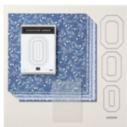
Countryside Inn Suite Collection - 161474