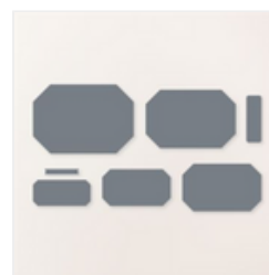
Countryside Corners Dies - 161471