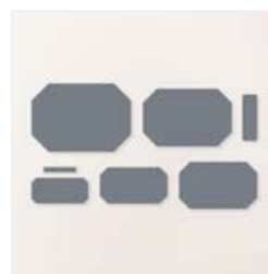
Countryside Corners Dies - 161471