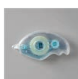
Stampin' Seal - 152813