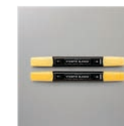
Daffodil Delight Stampin' Blends Combo Pack - 154883