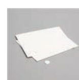
Stampin' Dimensionals - 104430