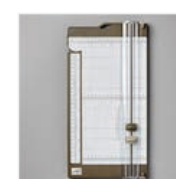
Paper Trimmer - 152392

Don't miss my other tutorials from the Countryside Inn Series!