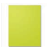
Lemon Lime Twist 8-1/2" X 11" Cardstock - 144245