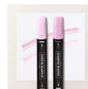
Bubble Bath Stampin' Blends Combo Pack - 161675