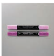
Blackberry Bliss Stampin' Blends Combo Pack - 154877