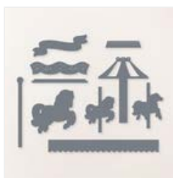
Carousel Horses Dies - 161465