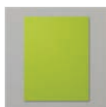
Granny Apple Green 8-1/2" X 11" Cardstock - 146990