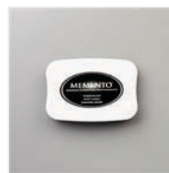
Tuxedo Black Memento Ink Pad - 132708