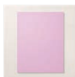
Fresh Freesia 8-1/2" X 11" Cardstock - 155613