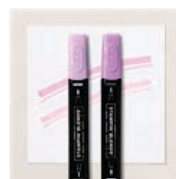
Fresh Freesia Stampin' Blends Combo Pack - 155518