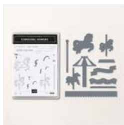
Carousel Horses Bundle - 161466

Tami White tami@stampwithtami.com www.stampwithtami.com