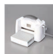
Stampin' Cut & Emboss Machine - 149653