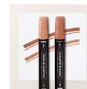
Copper Clay Stampin' Blends Combo Pack - 161662