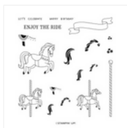
Carousel Horses Photopolymer Stamp Set (English) - 161463