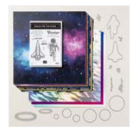
Stargazing Suite Collection (English) - 161189

Tami White tami@stampwithtami.com www.stampwithtami.com