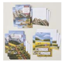
Exploring In Color Paper Pumpkin Refill - 163160