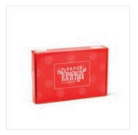
Prepaid Paper Pumpkin Subscription 1-Month - 137858