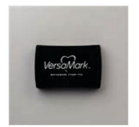
Versamark Pad -102283