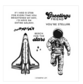
Reach For The Stars Cling Stamp Set (English) -161176