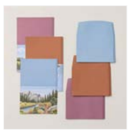
Exploring In Color Cards & Envelopes - 163113