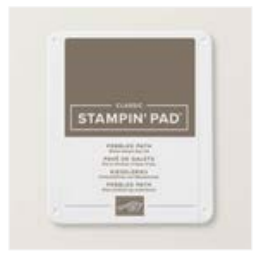
Pebbled Path Classic Stampin' Pad - 161648