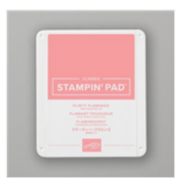
Flirty Flamingo Classic Stampin' Pad - 147052