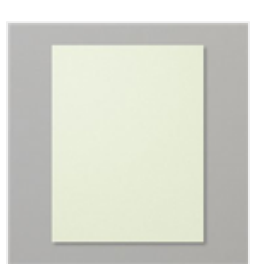
Soft Sea Foam 8-1/2" X 11" Cardstock -146988