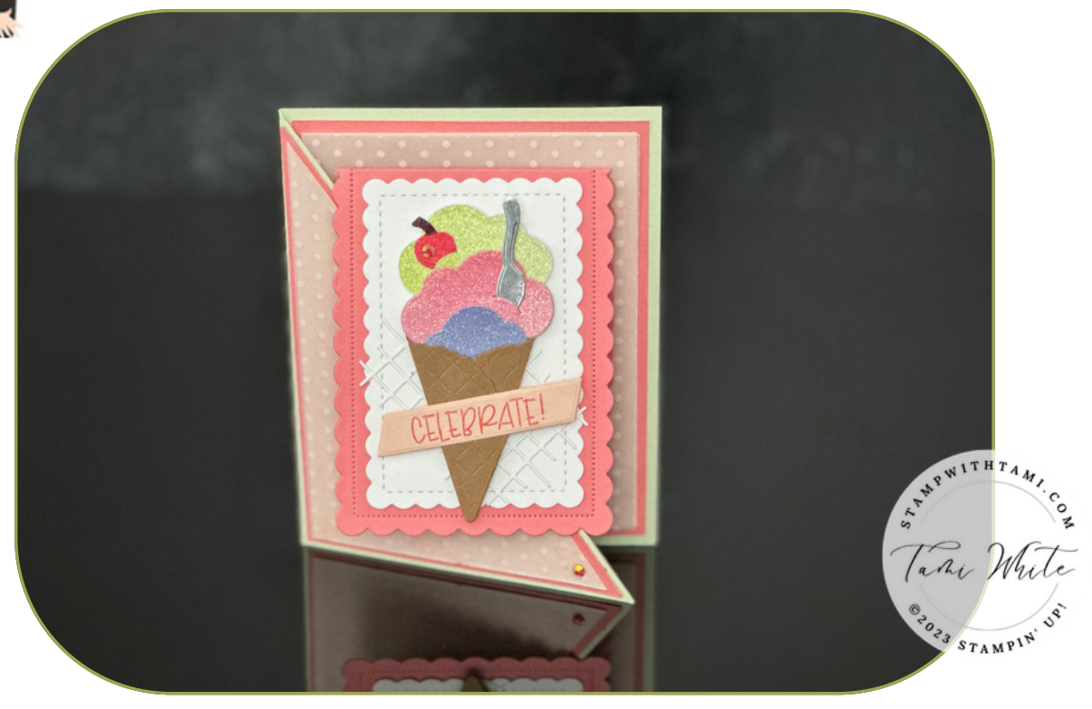
See my diagonal joy fold video tutorial for tips with this fold.

SHARE A MILKSHAKE DIAGONAL JOY FOLD CARD