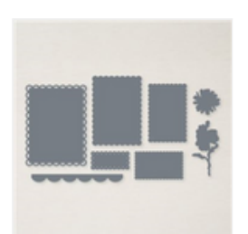
Scalloped Contours Dies -155560