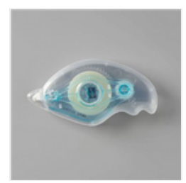
Stampin' Seal -152813