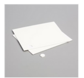
Stampin' Dimensionals -104430