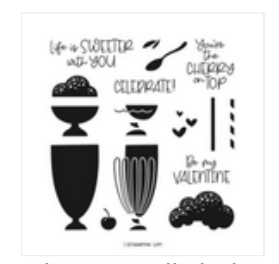
Share A Milkshake Photopolymer Stamp Set (English) - 160394

Tami White tami@stampwithtami.com www.stampwithtami.com