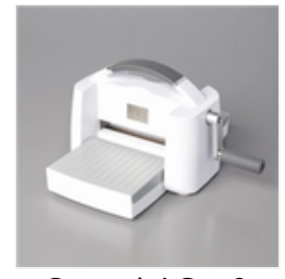
Stampin' Cut & Emboss Machine -149653