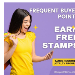
FREQUENT BUYER POINTS EARN FREE STAMPS TAMI'S CUSTOMER LOYALTY PROGRAM stampwithtami.com