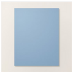
Boho Blue 8-1/2" X 11" Cardstock - 161724