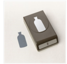
Vintage Bottle Punch - 158689