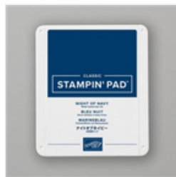
Night Of Navy Classic Stampin' Pad - 147110