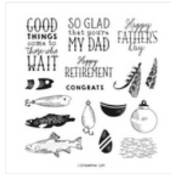
Gone Fishing Photopolymer Stamp Set (English) - 161535