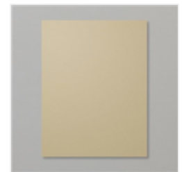
Crumb Cake 8-1/2" X 11" Cardstock - 120953