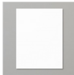
Basic White 8-1/2" X 11" Cardstock - 159276