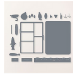
Gone Fishing Dies - 161541