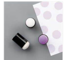
Sponge Daubers - 133773