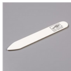
Bone Folder - 102300