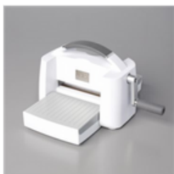
Stampin' Cut & Emboss Machine - 149653