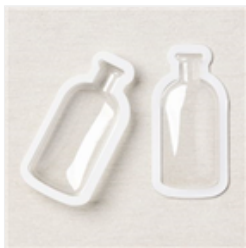
Vintage Bottle Shaker Domes - 158788