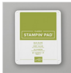
Old Olive Classic Stampin' Pad - 147090