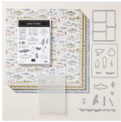
Let's Go Fishing Suite Collection (English) - 161546

Tami White tami@stampwithtami.com www.stampwithtami.com