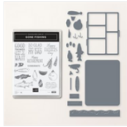
Gone Fishing Bundle (English) - 161542