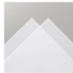
Vellum 8-1/2" X 11" Cardstock - 101856