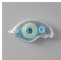
Stampin' Seal - 152813