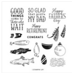
Gone Fishing Photopolymer Stamp Set (English) - 161535