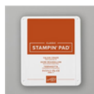
Cajun Craze Classic Stampin' Pad - 147085