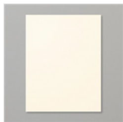
Very Vanilla 8-1/2" X 11" Cardstock - 101650