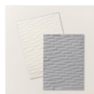
Twisted Rope 3D Embossing Folder - 161545