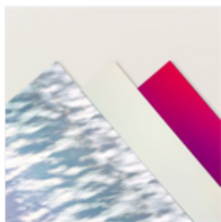
Holographic Trio 12" X 12" (30.5 X 30.5 Cm) Specialty Paper - 161744