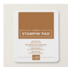
Pecan Pie Classic Stampin' Pad - 161665