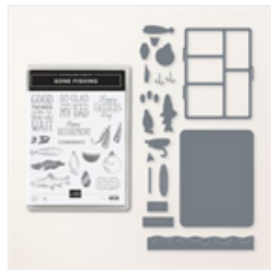
Gone Fishing Bundle (English) - 161542