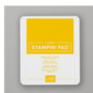
Crushed Curry Classic Stampin' Pad - 147087