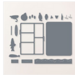
Gone Fishing Dies - 161541