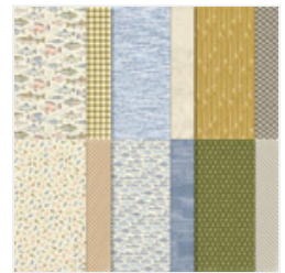
Let's Go Fishing 12" X 12" (30.5 X 30.5 Cm) Designer Series Paper - 161534