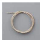
Linen Thread - 104199