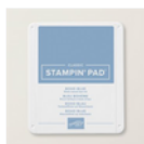
Boho Blue Classic Stampin' Pad - 161650