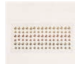
Brushed Metallic Adhesive Backed Dots - 156506