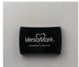
Versamark Pad - 102283