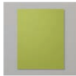
Old Olive 8-1/2" x 11" Cardstock - 100702