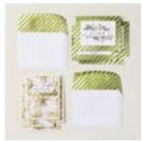
Forever Friends Kit (English) - 162363

New 2023-24 Annual Catalog Supplies: Lemon Lolly Cardstock