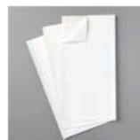
Adhesive Sheets - 152334