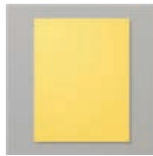
Daffodil Delight 8-1/2" x 11" Cardstock - 119683