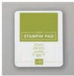
Old Olive Classic Stampin' Pad - 147090