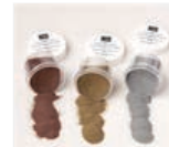
Metallics Embossing Powders - 155555