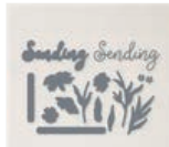
Sending Dies (English) - 159271