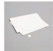
Stampin' Dimensionals - 104430