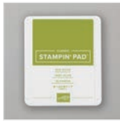
Old Olive Classic Stampin' Pad - 147090