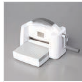
Stampin' Cut & Emboss Machine - 149653