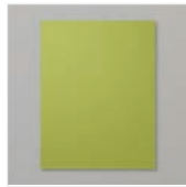
Old Olive 8-1/2" X 11" Cardstock - 100702