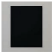
Basic Black 8-1/2" X 11" Cardstock - 121045