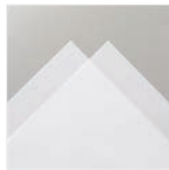
Vellum 8-1/2" X 11" Cardstock - 101856