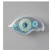
Stampin' Seal - 152813