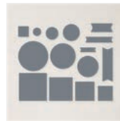
Stylish Shapes Dies - 159183