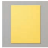
Daffodil Delight 8- 1/2" X 11" Cardstock - 119683