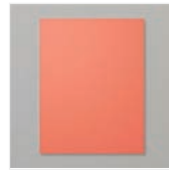
Calypso Coral 8- 1/2" X 11" Cardstock - 122925