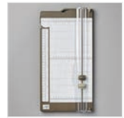
Paper Trimmer - 152392