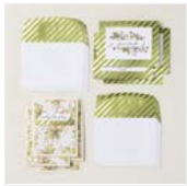
Forever Friends Kit (English) - 162363