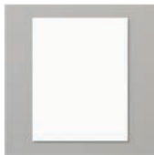
Basic White 8-1/2" X 11" Cardstock - 159276