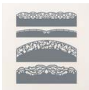
Elegant Borders Dies - 161593