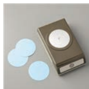
2" (5.1 Cm) Circle Punch - 133782