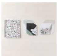
Birthday Card Organizer Kit - 161056

New 2023-24 Annual Catalog Supplies: Countryside Dies & Ribbon Duo Combo Cardstock: Lost Lagoon, Pecan Pie, Petal Pink, Gray Granite, Basic White & Basic Black