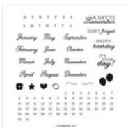
Days To Remember Photopolymer Stamp Set (English) - 155026