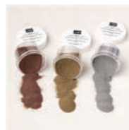
Metallics Embossing Powders - 155555