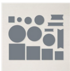
Stylish Shapes Dies - 159183