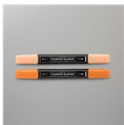
Pumpkin Pie Stampin' Blends Combo Pack - 154897