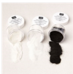
Basics Embossing Powders - 155554