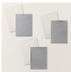
Basics 3D Embossing Folders - 161598