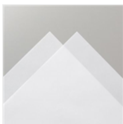
Vellum 8-1/2" X 11" Cardstock - 101856