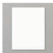
Basic White 8-1/2" X 11" Cardstock - 159276