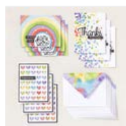
Saying Thanks Kit - 162361

New 2023-24 Annual Catalog Supplies: Azure Afternoon Cardstock & Lemon Lime Twist Cardstock