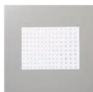
Rhinstone Basic Jewels - 144220