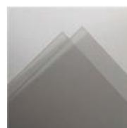
Window Sheets - 142314