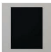
Basic Black 8-1/2" X 11" Cardstock - 121045