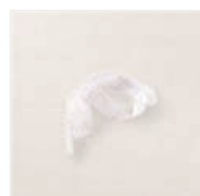
White 3/8" (1 Cm) Glittered Organdy Ribbon - 156408