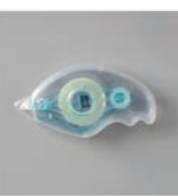
Stampin' Seal - 152813