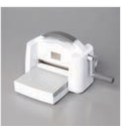
Stampin' Cut & Emboss Machine - 149653