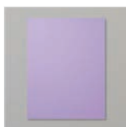
Highland Heather 8-1/2" X 11" Cardstock - 146986