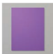
Gorgeous Grape 8- 1/2" X 11" Cardstock - 146987