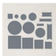
Stylish Shapes Dies - 159183