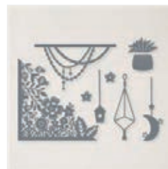
Enchanting Details Dies - 159166