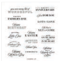
Celebrating You Cling Stamp Set (English) - 158028