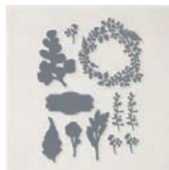
Natural Prints Dies - 158800