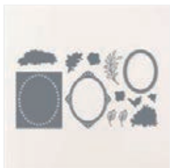
Framed Florets Dies - 160623