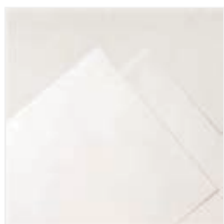
Pearlescent Specialty Paper - 154291

Tami White tami@stampwithtami.com www.stampwithtami.com