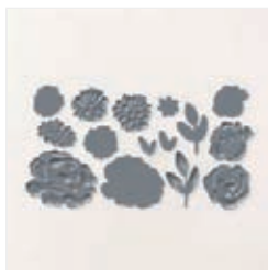
Brushed Bouquet Dies - 160473