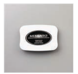
Tuxedo Black Memento Ink Pad -132708