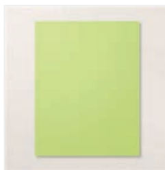
Parakeet Party 8-1/2" X 11" Cardstock - 159259