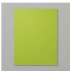
Granny Apple Green 8-1/2" X 11" Cardstock - 146990