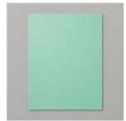
Coastal Cabana 8-1/2" X 11" Cardstock - 131297