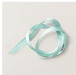
Pool Party 3/8" (1 Cm) Grosgrain Ribbon - 160430