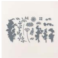
Dainty Delight Dies - 160674