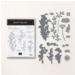
Dainty Delight Bundle (English) - 160675

Tami White tami@stampwithtami.com www.stampwithtami.com