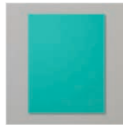
Bermuda Bay 8-1/2" X 11" Cardstock - 131197