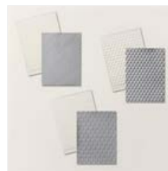
Basics 3D Embossing Folders - 161598