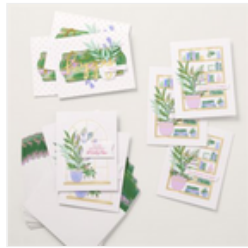
Ten Years Of Growth Paper Pumpkin Refill - 162989