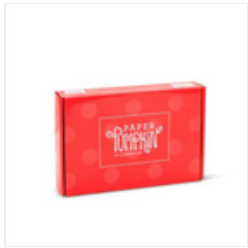
Prepaid Paper Pumpkin Subscription 1- Month - 137858

Tami White tami@stampwithtami.com www.stampwithtami.com