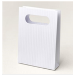
Embossed Treat Bags - 159251