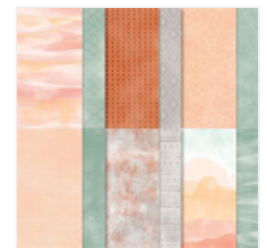
Delicate Desert 12" X 12" (30.5 X 30.5 Cm) Designer Series Paper - 160521