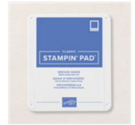
Orchid Oasis Classic Stampin' Pad - 159214