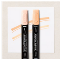
Pale Papaya Stampin' Blends Combo Pack - 155519