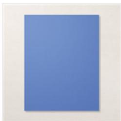
Orchid Oasis 8- 1/2" X 11" Cardstock - 159267