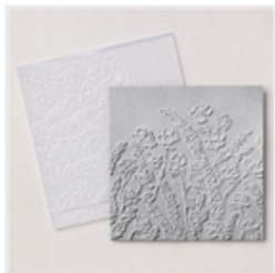
Painted Posies 3D Embossing Folder - 159175