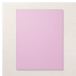
Fresh Freesia 8- 1/2" X 11" Cardstock - 155613