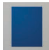
Night Of Navy 8-1/2" X 11" Cardstock - 100867