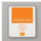
Pumpkin Pie Classic Stampin' Pad - 147086