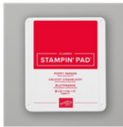
Poppy Parade Classic Stampin' Pad - 147050