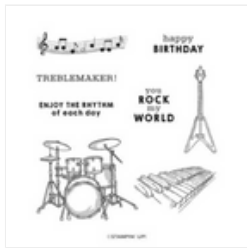
Enjoy The Rhythm Cling Stamp Set (English) - 160361

Tami White tami@stampwithtami.com www.stampwithtami.com