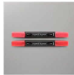
Poppy Parade Stampin' Blends Combo Pack - 154958