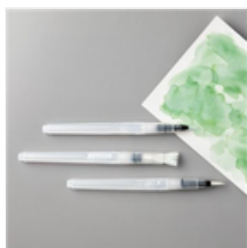
Water Painters - 151298