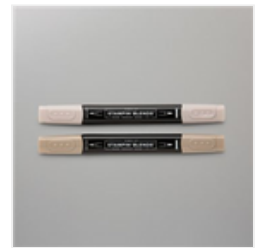
Crumb Cake Stampin' Blends Combo Pack - 154882