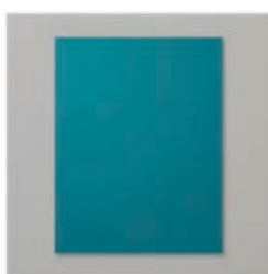
Pretty Peacock 8-1/2" X 11" Cardstock - 150880