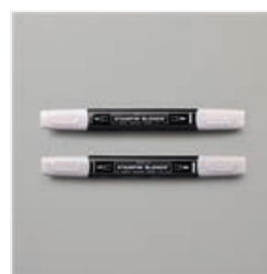
Gray Granite Stampin' Blends Combo Pack - 154886