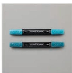
Pretty Peacock Stampin' Blends Combo Pack - 154895