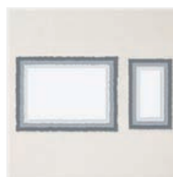
Deckled Rectangles Dies - 159173