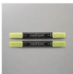
Granny Apple Green Stampin' Blends Combo Pack - 154885