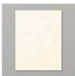
Very Vanilla 8-1/2" X 11" Cardstock - 101650