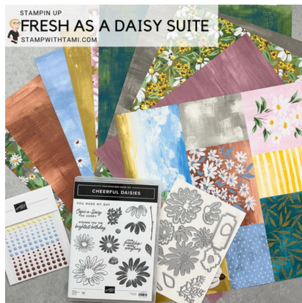
The designer paper is from the new Fresh as a Daisy collection.