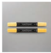
Daffodil Delight Stampin' Blends Combo Pack - 154883