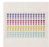
Glossy Dots Assortment - 158827