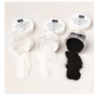
Basics Embossing Powders - 155554