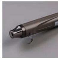
Heat Tool - 129053