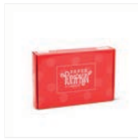
Prepaid Paper Pumpkin Subscription 1- Month - 137858

Tami White tami@stampwithtami.com www.stampwithtami.com