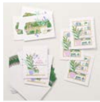
Ten Years Of Growth Paper Pumpkin Refill - 162989