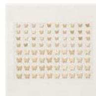
Brushed Brass Butterflies - 158136