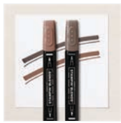
Stampin' Blends Deep Combo Pack - 158152