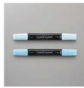
Balmy Blue Stampin' Blends Combo Pack - 154830