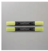
Granny Apple Green Stampin' Blends Combo Pack - 154885