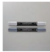
Basic Black Stampin' Blends Combo Pack - 154843