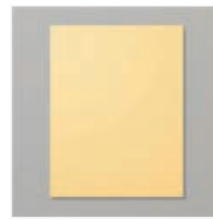
So Saffron 8-1/2" X 11" Cardstock - 105118