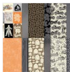
Ready To Ride 12" X 12" (30.5 X 30.5 Cm) Specialty Designer Series Paper - 160752