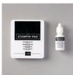
Uninked Stampin' Pad & Whisper White Refill - 147277