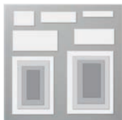
Rectangle Stitched Dies - 151820