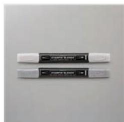
Smoky Slate Stampin' Blends Combo Pack - 154904