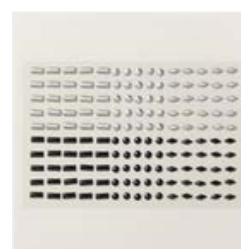
Adhesive-Backed Studs - 160767