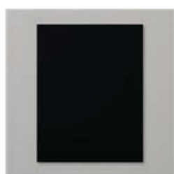
Basic Black 8-1/2" X 11" Cardstock - 121045