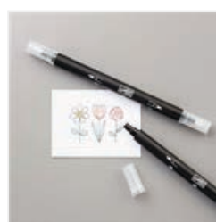
Blender Pens - 102845