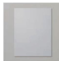
Smoky Slate 8-1/2" X 11" Cardstock - 131202