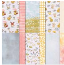
Rain Or Shine Specialty 12" X 12" (30.5 X 30.5 Cm) Designer Series Paper - 160540