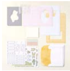
Sunshine & Smiles Paper Pumpkin Kit Refill 161916