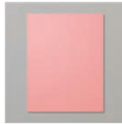
Flirty Flamingo 8- 1/2" X 11" Cardstock - 141416