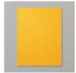
Mango Melody 8- 1/2" X 11" Cardstock - 146989